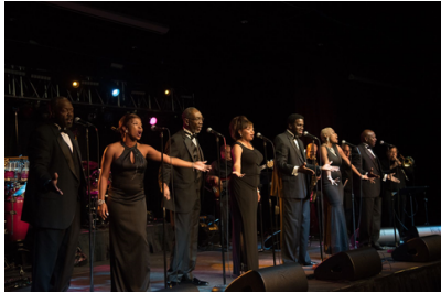
The Fabulous Motown Revue will be the headline act at Hazelwood Day.

Keep an eye out for updated information as it becomes available.