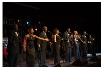
Fabulous Motown Reveiw

This very popular and entertaining act will perform from 6:00-9:00 pm.