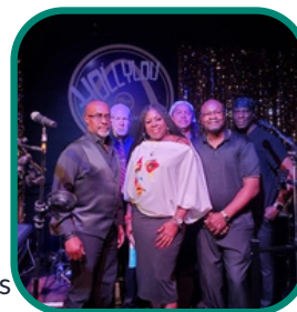
Chaz 45 Band

Free entertainment will also highlight the festivities starting with the Chaz 45 Band from 3:00-5:00p.m.