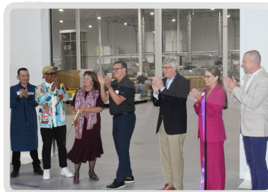
Marson Foods Ribbon Cutting at Hazelwood Tradeport