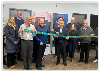
IDI Ribbon Cutting at Hazelwood Business Park