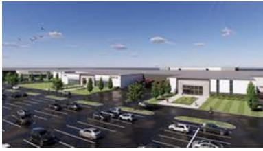
Hazelwood Business Park, owned and operated by ICP