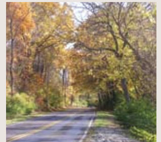
Howdershell Park; Aubuchon Road

Conveniently located just northwest of St. Louis and with direct access to major thoroughfares, Hazelwood is easily accessible and provides an alluring contrast between metropolitan vibrancy and suburban convenience.